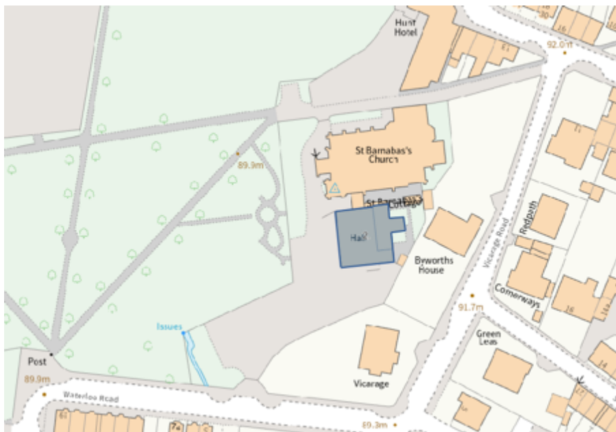
Contains public sector information licensed under the Open Government Licence v3.0. Terms and Conditions apply.